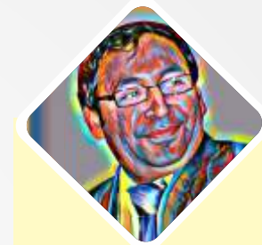
Value Management Solution Pvt Ltd