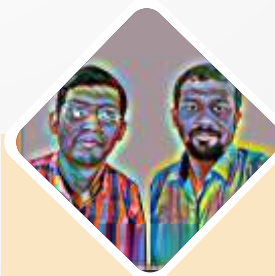
Navkar Equity Solutions Pvt Ltd