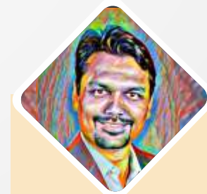
Tirth Stock Broking